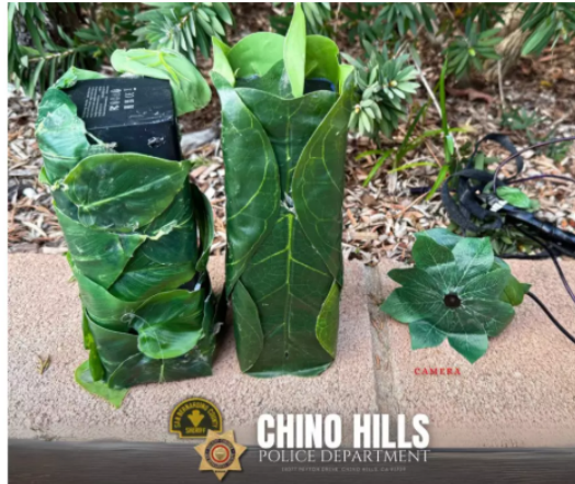
An image posted to the Chino Hills Police Department's social media page shows a hidden camera equipped with two large portable batteries found in a Chino Hills driveway.