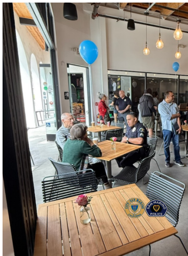
Coffee with a Cop