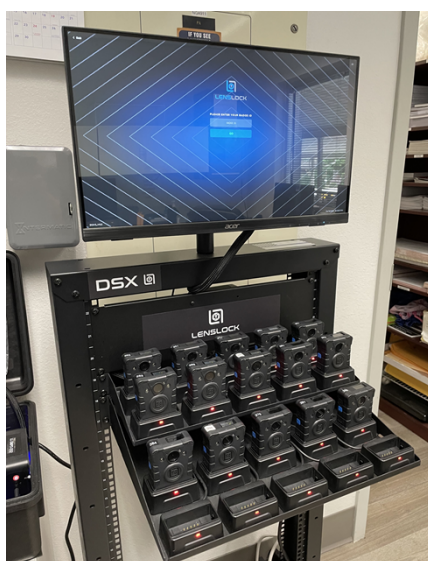
LensLock Body Worn Camera Docking Station